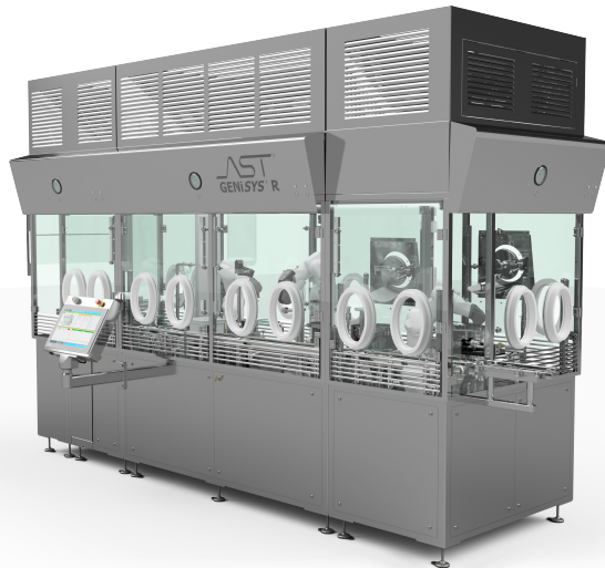
GENiSYS R: Robotic fill finish at 20 units/minute