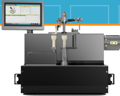
GENiSYS Lab: Semi-automatic container processing