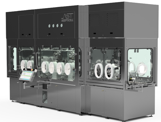
ASEPTiCell: Robotic fill finish at 100 units/minute